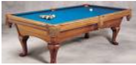
Like Brand New Pool table. Paid $2,500

Spreading Awareness of Sudden Cardiac Arrest